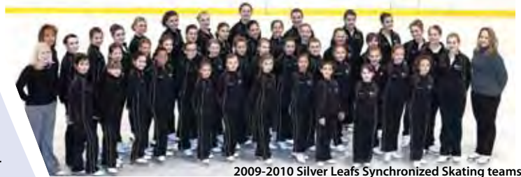
2009-2010 Silver Leafs Synchronized Skating teams

Please check www.leafsicecentre.com for additional Summer Camp information.