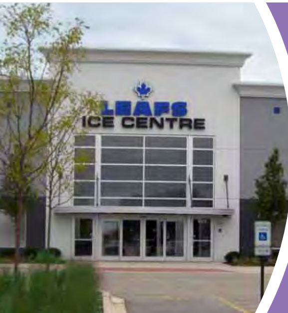
Figure Skating, Hockey, Public Skating, Camps, and Conditioning for all ages— the Leafs Ice Centre has it all!

The Leafs Ice Centre is a state-of-the-art ice facility located five minutes from I-90 at Randall Road. We have three NHL-size rinks, an off-ice training centre and a studio rink that can be used for private lessons, goalie training or small birthday parties. The Leafs Ice Centre is considered a one-of-a-kind ice facility – the best in the midwest!